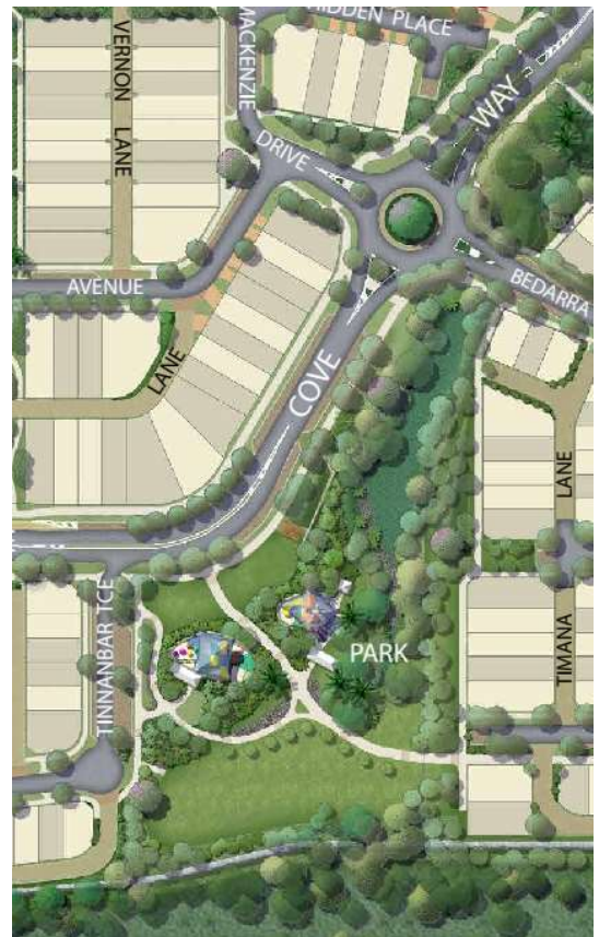
A sneak peak at the layout of the new park currently taking shape on the edge of the new Bedarra Precinct

Even though the rain has been consistent for the last 6 weeks, all of the parklands and landscaping within our sunshine Cove community have benefited greatly!