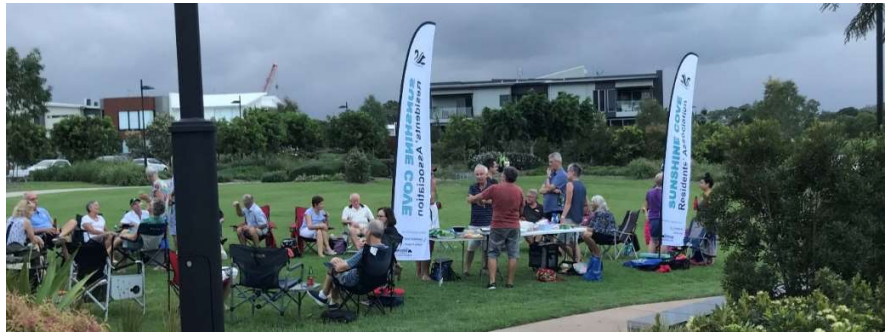
Photo from the recent SCRA Fridays in the Park, it was great to see so much support for the community.

As you may be aware, the Sunshine Coast Regional Council has a Group who meet every 6 months to monitor the performance of the gardeners within Sunshine Cove. At each meeting, the Council tables a landscaping performance report on a section of Sunshine Cove and ranks the performance of the gardeners. This report is discussed as well as any other landscaping matters that people bring forward. The Group is in need of additional representation from the Sunshine Cove Residents, preferably one from each area. If this is something you may be interested in, please email the SCRA to express your interest.